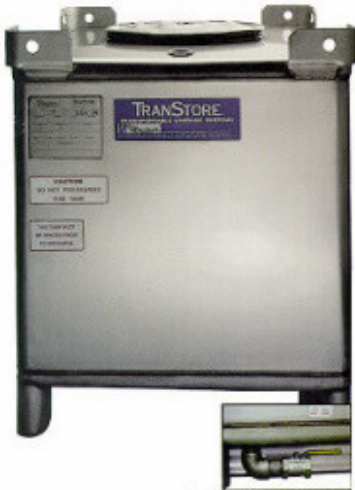
Standard 2" stainless steel outlet assembly.

Mitchell Container Services, Inc. provides the highest quality TranStore IBCs from Custom Metalcraft, Inc. These IBCs deliver unsurpassed quality, flexibility, and value. They are the most advanced industrial tank since their introduction into the market.